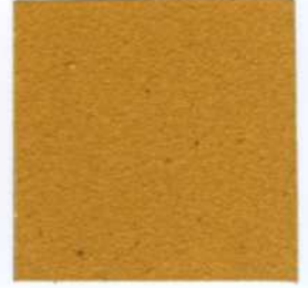
920 Safety Yellow