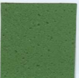
828 Seafoam Green