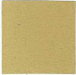
305 Adobe Buff

PaveCrete 100-PaveCrete 200-PaveCrete 220-PaveCrete 300-PaveCrete 500-PaveCrete 630-PaveCrete 700-TopCrete 601-Top PaveCrete 100-PaveCrete 200-PaveCrete 220-PaveCrete 300-PaveCrete 500-PaveCrete 630-PaveCrete 700-TopCrete 601-Top