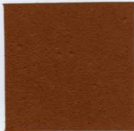
510 Royal Peach