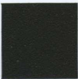
200 Medium Gray