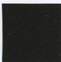
100 Dark Gray