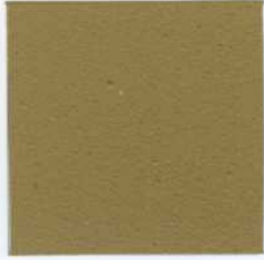
310 Cream Beige