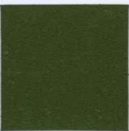
820 Muted Green