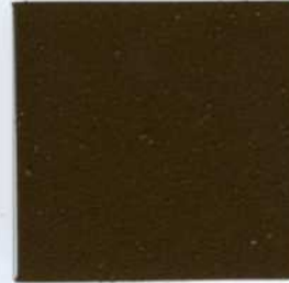
350 Desert Tan