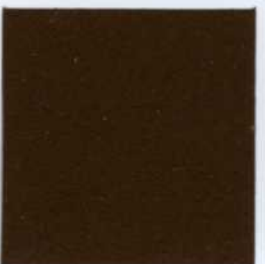
425 Autumn Brown