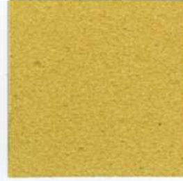
910 Pale Yellow