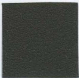
600 Light Gray