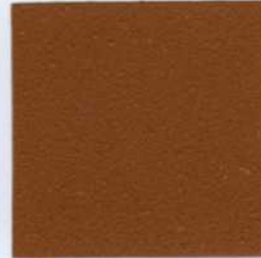
515 Sunbaked Clay