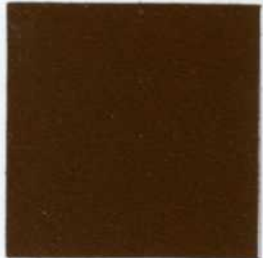
700 Terra Cotta