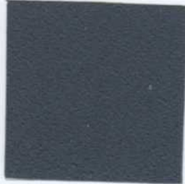
625 Dover Blue