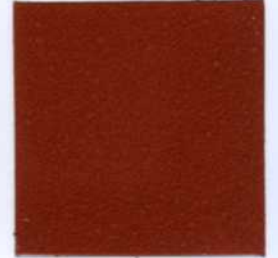
505 Quarry Red

-Custom Colors and Color Matching Available-