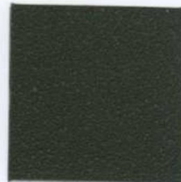
650 Smokey Blue